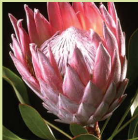
National flower: King protea