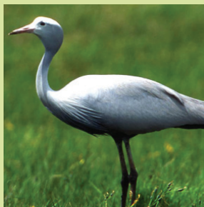
National bird: Blue crane