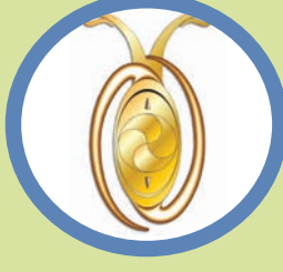
The Order of the Companions of OR Tambo