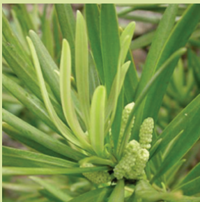
National tree: Real yellowwood