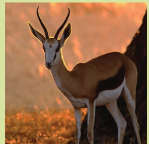
National animal: Springbok