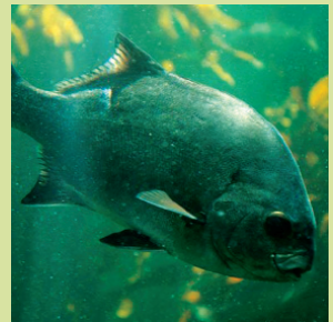
National fish: Galjoen